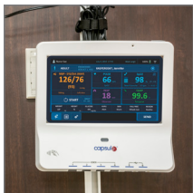
Smartlinx Vital Plus