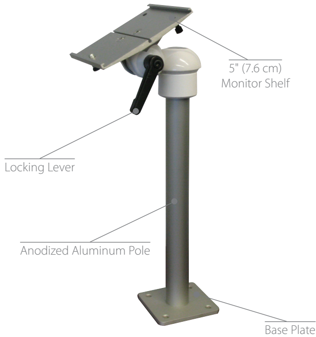
Part Number: TTM-12-450-A00