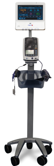
Capsule Neuron on Roll Stand

Amico Accessories Inc. offers a variety of device integration solutions – please consult our sales reps at info@amico-accessories.com