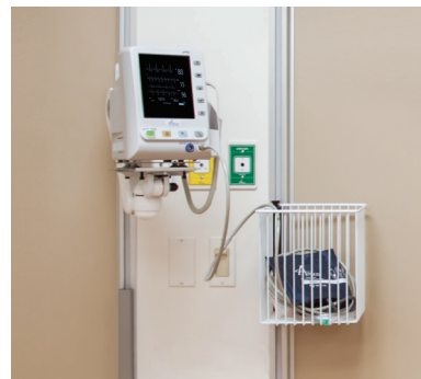
Amico Vital Signs on Direct Mount AHM