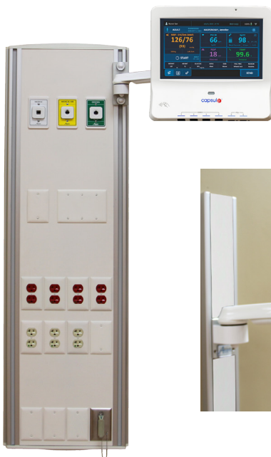
Capsule Neuron on Channel Mount SSM

Beyond providing mounting solutions, our Capsule mounting line aims to maximize flexibility and ergonomics. We do this by providing a broad range of mounting configurations that include varying arm lengths and also the capability to mount to existing monitor arm and IT setups. As the approved vendor for Capsule Neuron we provide hospitals with the confidence in knowing our solutions are made specifically for this application and have been properly tested to meet high level UL certification.