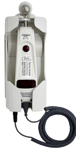
Exergen 134305/134307 Exergen 134306 (not shown) Exergen 134308 (not shown)