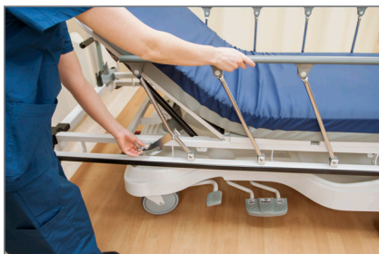
Adjustable Side Rails