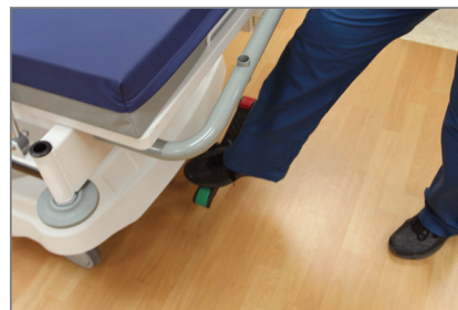
Brake/Steer Foot Pedal