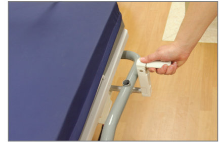
Knee Surface Articulation Crank