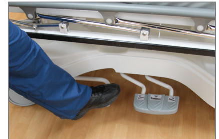
Hi-Lo Function Foot Pedal