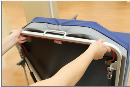
Head Section Articulation