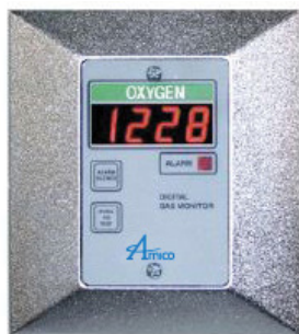
Oxygen Monitor with 5" * 5.5" chrome trim plate