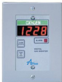
Oxygen Monitor with 4" * 5.25" grey aluminum trim plate