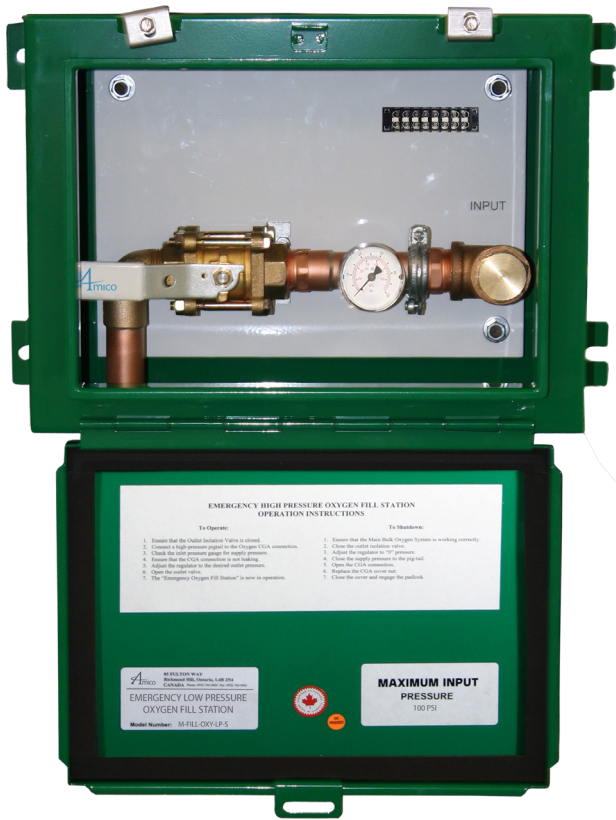
Model Number: M-FILL-OXY-LP-S