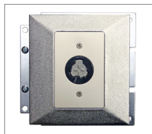
Electrical Twist Receptacle (HG) 20A Blk O-WAL-TWIST