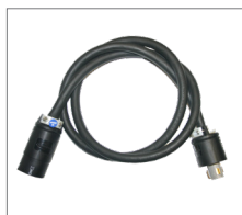
Cable Assembly - Twist M*F O-TWIST-CBL-DUB-XX