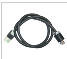
Cable Assembly - Twist M*F Simplex O-TWIST-CBL-SIM-XX