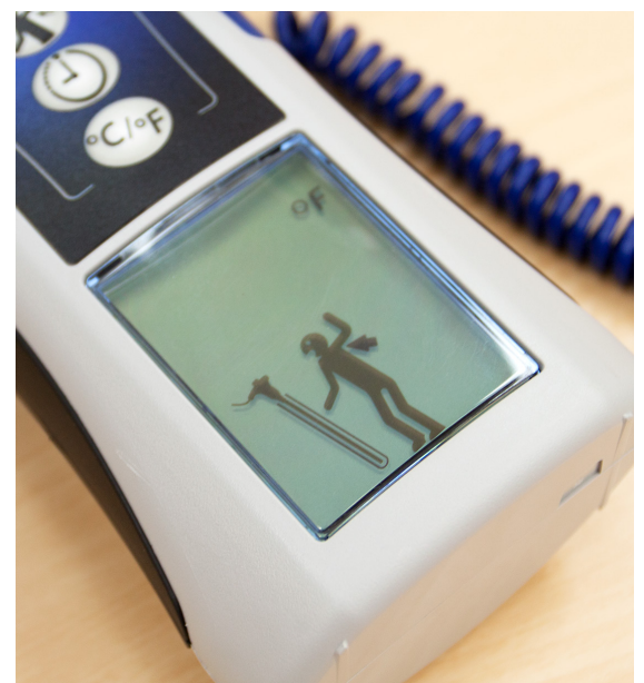
Predictive Thermometry LCD Screen

Minimizing cross contamination is made a priority with touchless loading and ejecting of the single use probe covers. A full swap, including probe covers, occurs when converting between oral/axillary and rectal measurements, further protecting against possible infection.