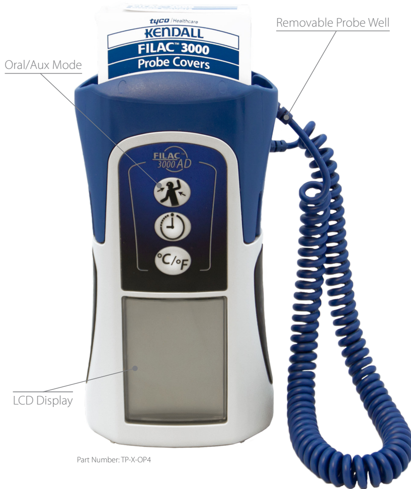
Part Number: TP-X-OP4