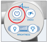
Switch on the light at lighthouse