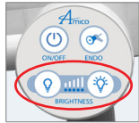
Set the required luminosity with 5 dimming levels