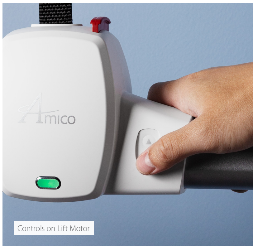
Controls on Lift Motor