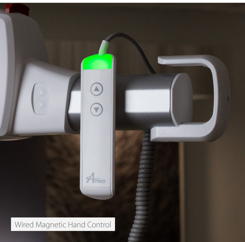
Wired Magnetic Hand Control