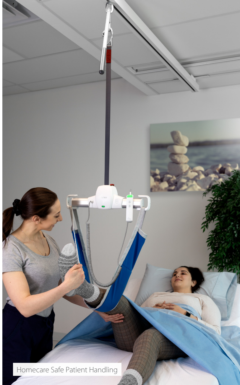
Homecare Safe Patient Handling