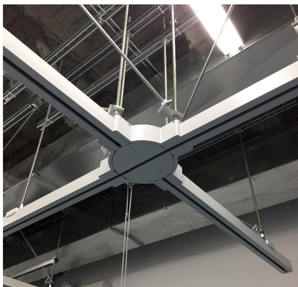
Typical Installation using Unistrut hardware and 1/2" (12.7 mm) threaded rods