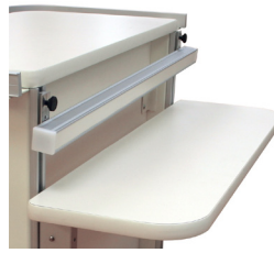
Height Adjustable Flip Up Shelf