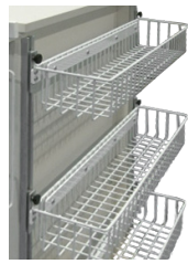
Back Baskets 10" x 10" x 4" 24" x 5" x 3"