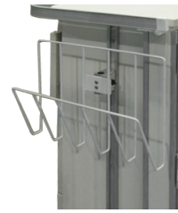
Integrated Accessory Rail