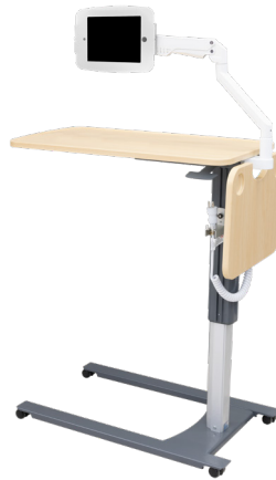
Flip Tablet Mount Table