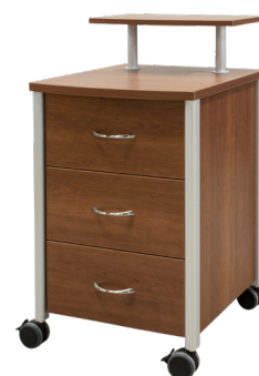
Lucas Series (Laminate or Thermofoil)