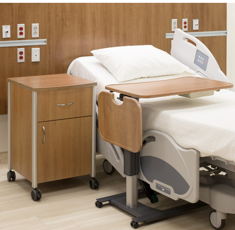
Coordinate with Your Patient Room