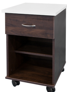
Jasper Series (Laminate)

Amico's bedside cabinets feature contemporary designs and durable construction to meet the demanding needs of today's healthcare environment. Manufactured using seamless thermofoil and high-pressure laminate, these cabinets come with various hardware and drawer front styles to choose from. With different drawer configurations and optional features including casters, drawer liners or spill guard tops, our Bedside Cabinets can be customized to suit any existing décor.