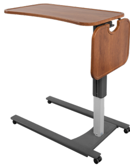
Flip Kidney Table