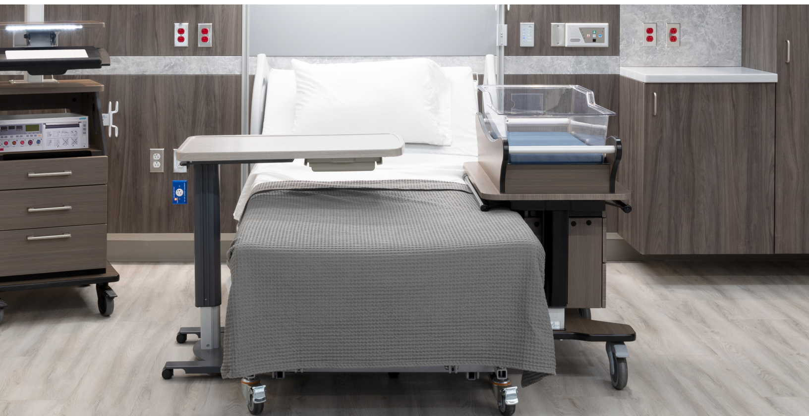
Unmatched Safety and Closeness