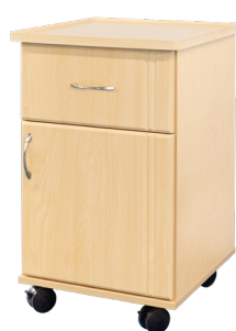
Oliver Series (Thermofoil)