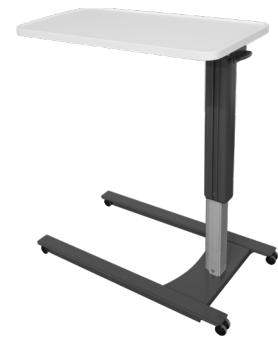
Solid Surface Table (Corian)