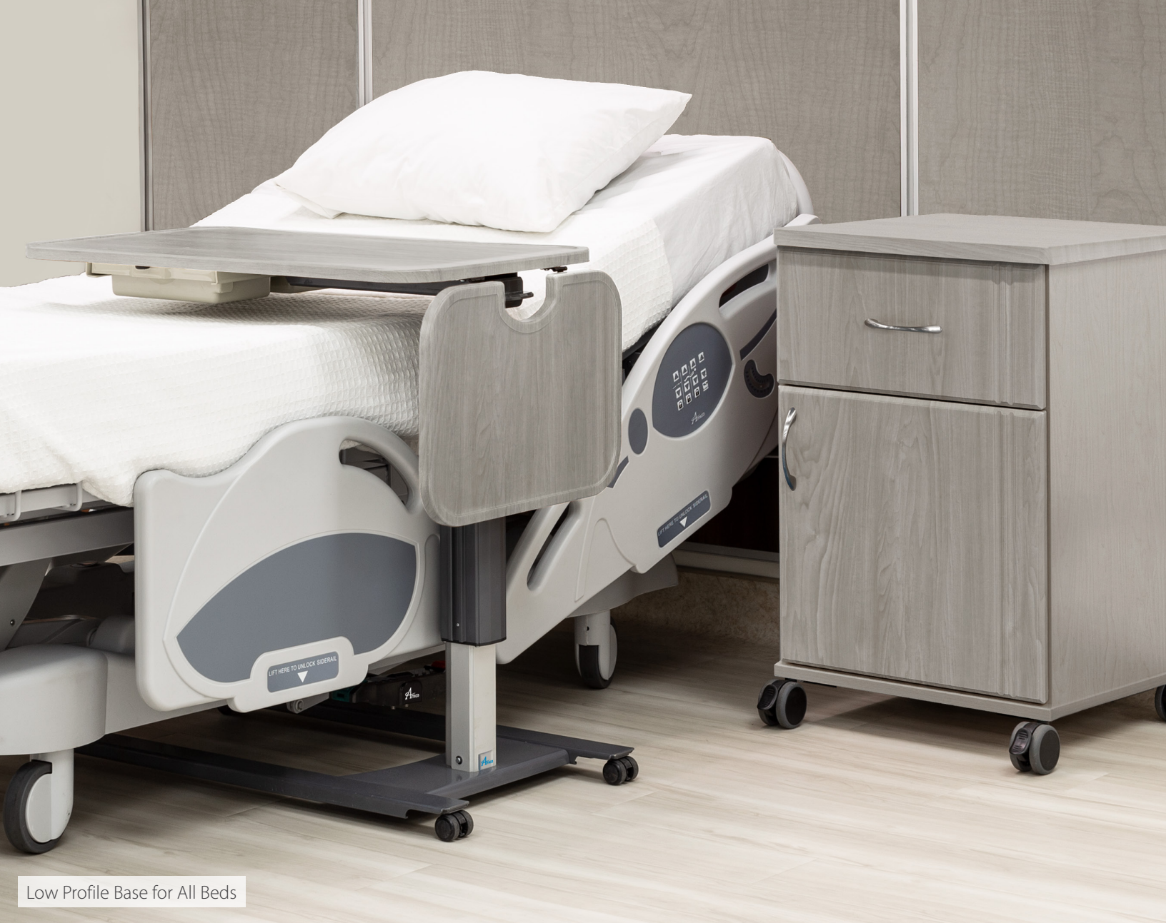
Low Profile Base for All Beds