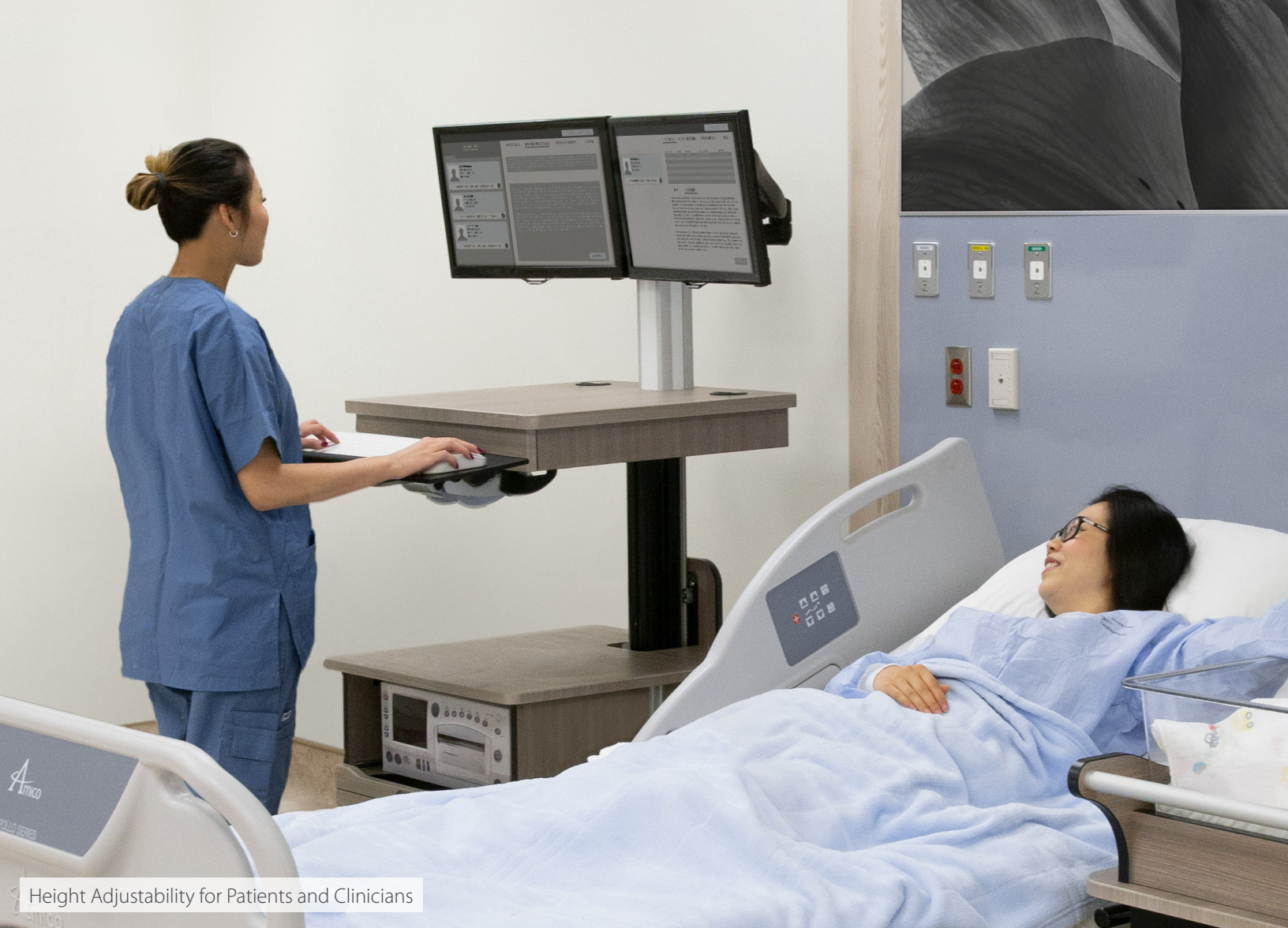
Height Adjustability for Patients and Clinicians