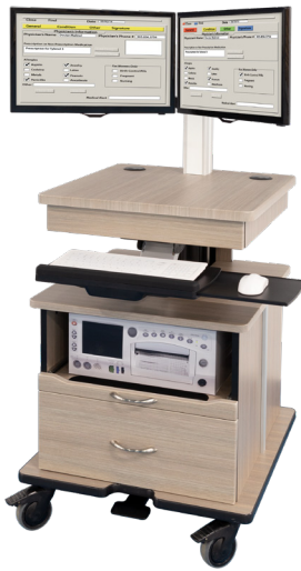
Fetal Monitor Carts

Amico understands that the moment of Labor and Delivery can be stressful. When time is tight, the clinical team needs to be in the best position to care. To help, we created the first series of height adjustable labor and delivery equipment in the market. Our Sit-to-Stand fetal monitor cart allows the nurse to work seated or standing. The height adjustable delivery cart allows for unprecedented nurse and doctor access to really fit into your labor situation. Our fully height adjustable bassinet is not only great for nurse ergonomics, but allows Mom to get close to the baby while in bed, keeping the mother/baby interaction safe and comfortable.