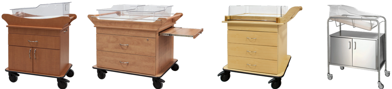
(Single) Marco Series

Amico's Bassinets are crafted using the highest quality materials designed for long lasting durability to create a home-like environment in labor and delivery departments. Available in high-pressure laminate or seamless thermofoil finishes, our bassinets can be customized with various drawer and door configurations, as well as hardware options and additional features for charts and writing surfaces.