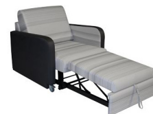
Wall Saver Feature (Sleep surface extends outward while unit remains stationary)