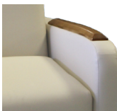
Wood or Black Arm Caps